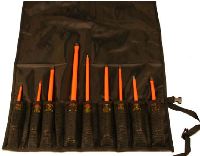
Image for illustrative purposes only— TR-9SD screwdriver roll pictured.