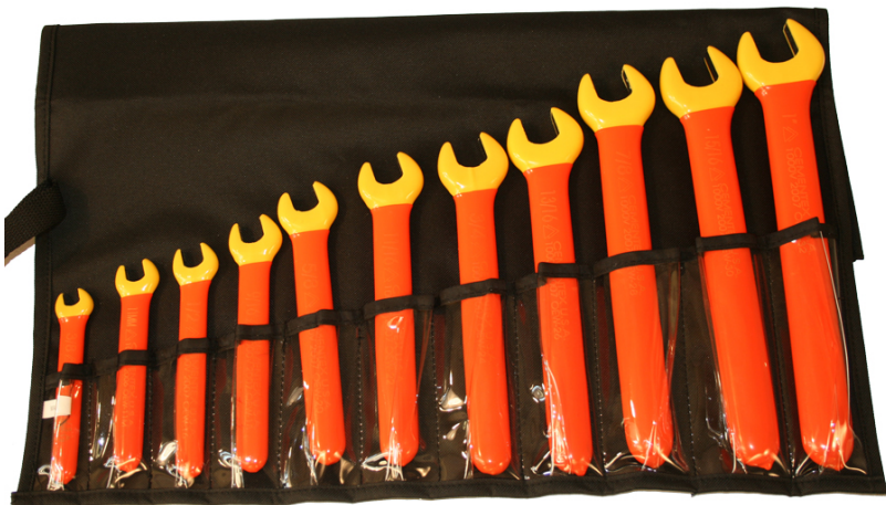
Photo is only meant to be representative of the IOEWS-17M kit.